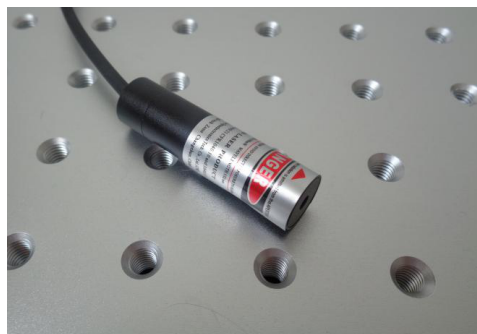
Φ12×45(L) mm 2 , 0.01 kg