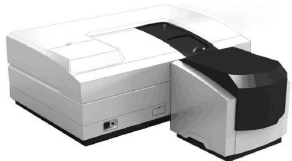
Agilent Cary-7000 (2sets) for reflectivity measurement ranging from 175-3300nm