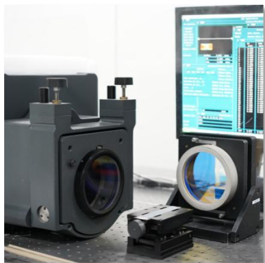
ZYGO Interferometer: parallelism & wave front Parallelism measure accuracy: 0.5 "