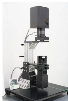
JAW Ellipsometry Retardation Measurement